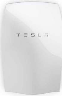
POWERWALL TESLA HOME BATTERY

Designed to eliminate DC voltage and current during installation, maintenance, or firefighting